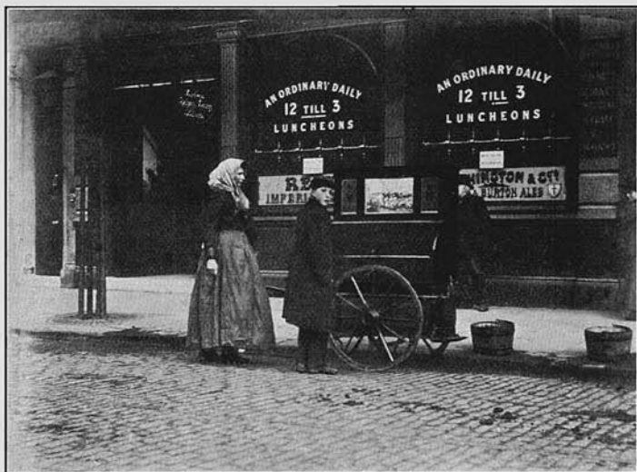
The writer's first halt.