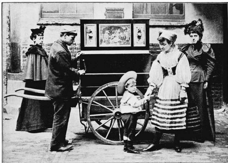
ORGAN-GRINDERS AT WORK.

Figure 1. "Organ-Grinders at Work." Sparrow, "London Street Toilers," 249.