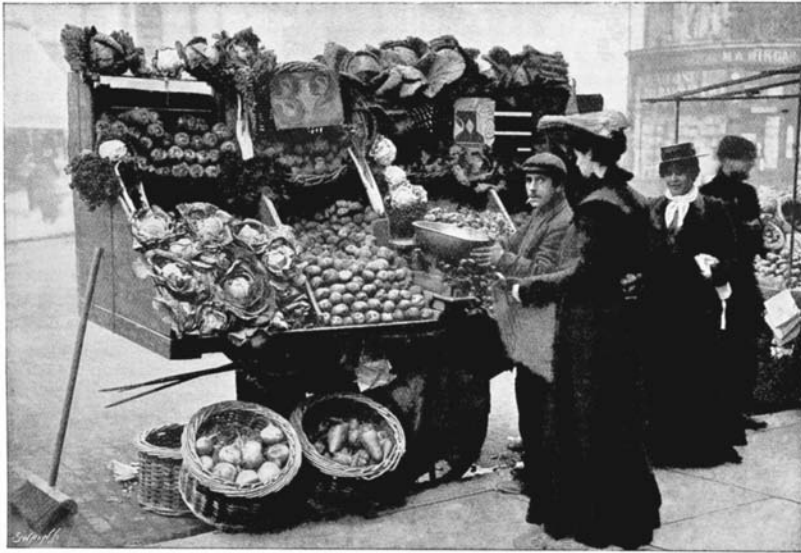
A coster's vegetable stall, from which Miss Malvery helped to sell. Very large numbers of the poor rely for practically all their supplies on the costers' stalls.