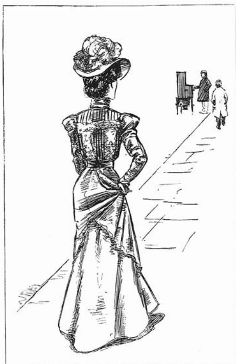
In the square were my boys with the organ.

Figure 7. "In the square were my boys with the organ." Bourne, "A Lady's Experiences as an Organ-Grinder," 26.