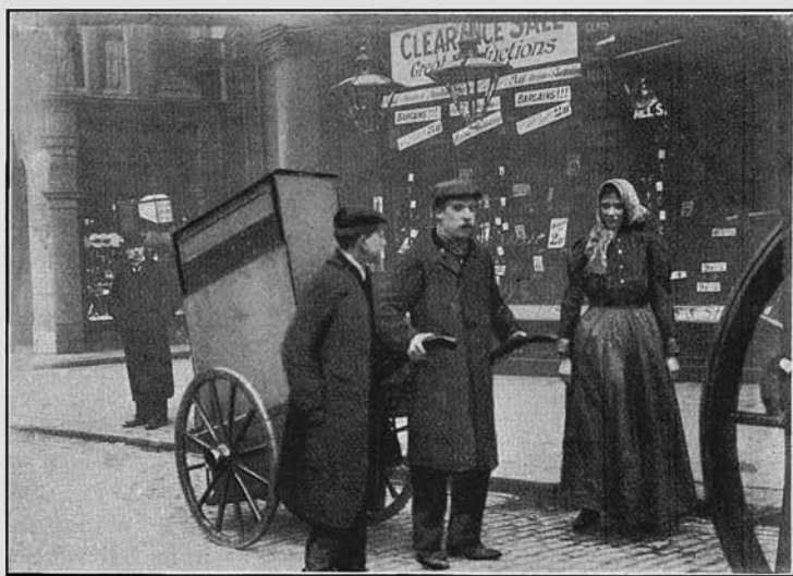
In the Italian manner.