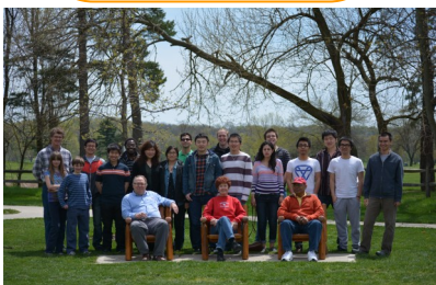
Electro-Optics Spring (top) and Fall (bottom) picnics 2013. Both were held at the Hills and Dale Park.