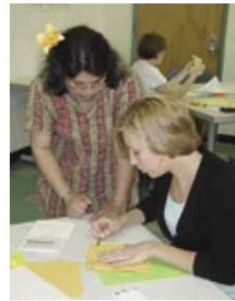
Mathematics through Origami