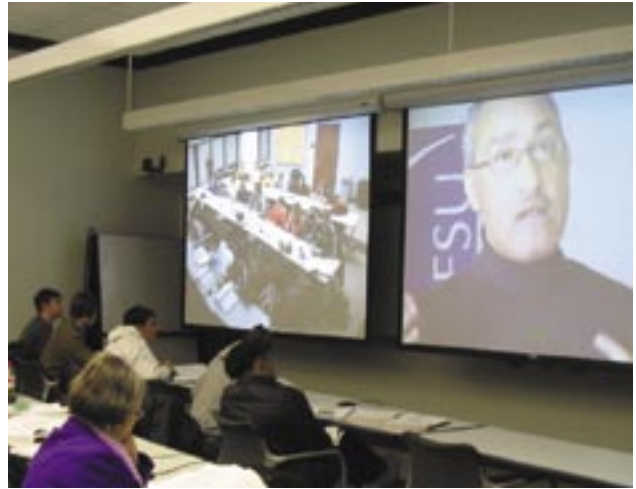
The Department of Languages offered distance-learning Arabic classes in fall 2005, and winter 2006

To schedule the use of this equipment in the LTC Forum, please contact the LTC receptionist at LTC@notes.udayton.edu .