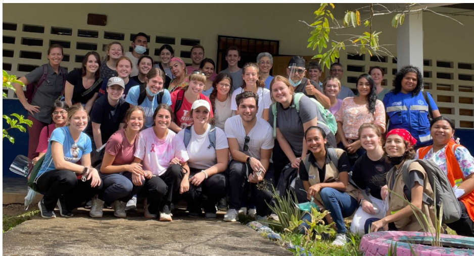
STUDENTS IN PANAMA WITH GLOBAL BRIGADES

University of Dayton Premedical Programs