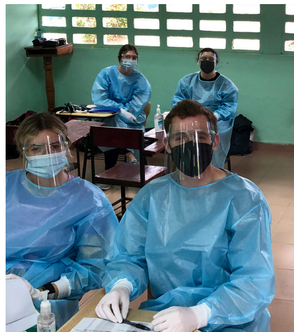
STUDENTS IN PANAMA PREPARING TO CHECK PATIENT VITALS