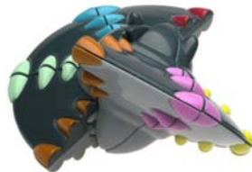
(puzzle in the midst of a twist)

A scrambling of the puzzle corresponds to a permutation of the puzzle pieces. My first step in solving the puzzle was to name the pieces. In the solved state, I chose the top piece containing the trademark label to be piece number 1 and continued naming clockwise on the top 2, 3, 4, 5