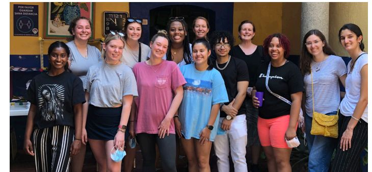
STUDENTS IN MEXICO WITH CHILD & FAMILY HEALTH INTERNATIONAL