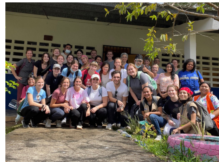
STUDENTS IN PANAMA WITH GLOBAL BRIGADES