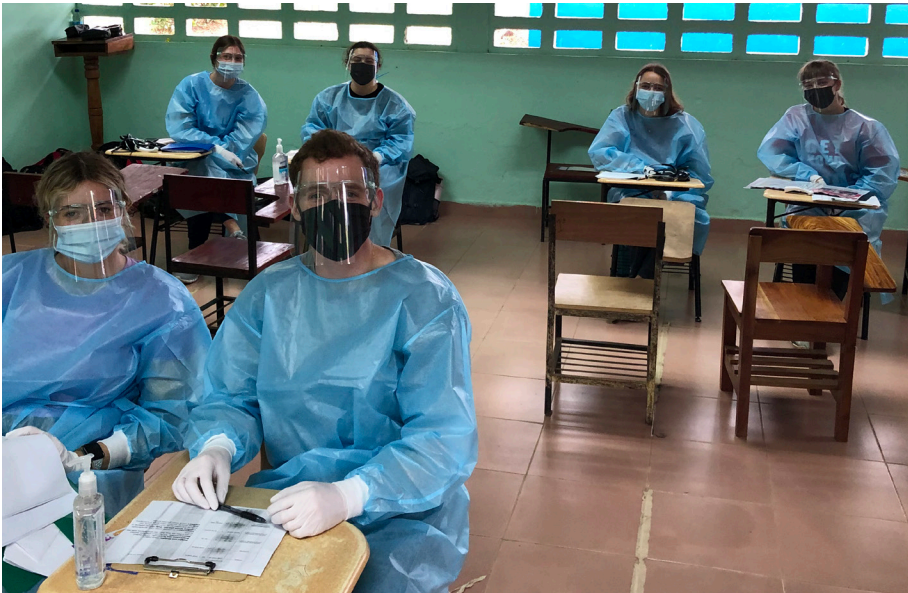
STUDENTS IN PANAMA PREPARING TO CHECK PATIENT VITALS