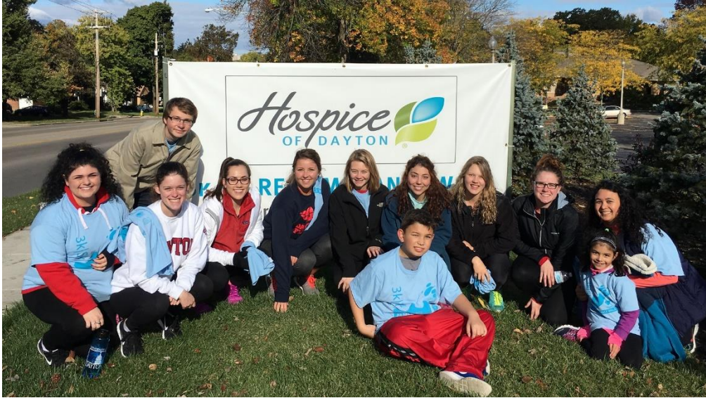
FIRST YEAR STUDENTS PARTICIPATE IN THE HOSPICE OF DAYTON REMEMBRANCE WALK