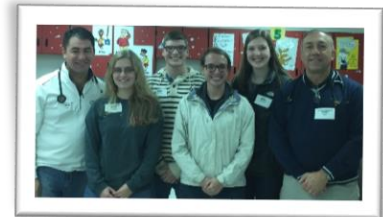
Healing Hearts student officers are pictured above with volunteer doctors at RAM Clinic held 10/22-23, 2016.

Healing Hearts club officers participated in a RAM clinic in Elkview, WV on 10/22 -10/23 (pictured top right). RAM provides free dental, vision, and medical services to underserved rural populations. At this particular clinic, 456 patients were seen and $213, 016 in services were provided.