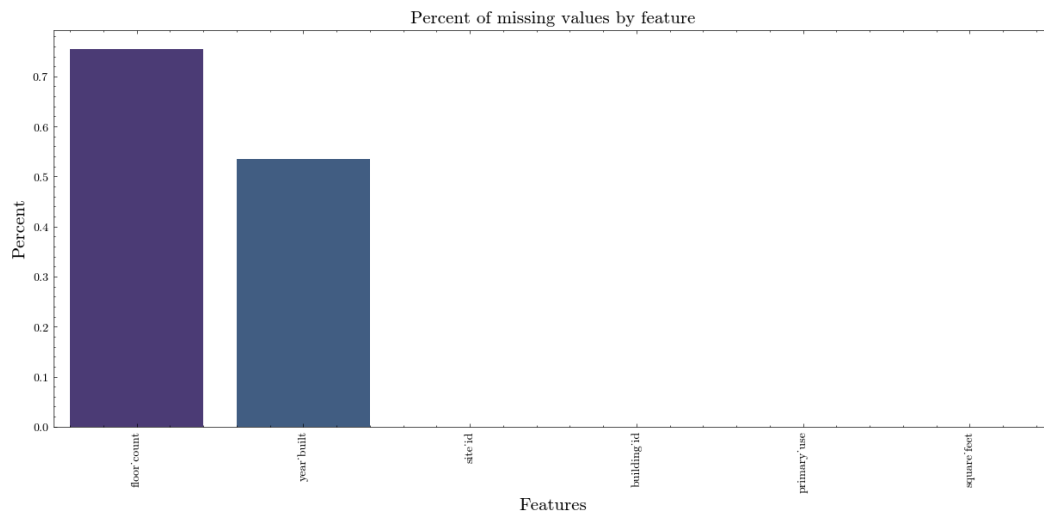
Figure 1: Missing Data in Building Metadata Dataset