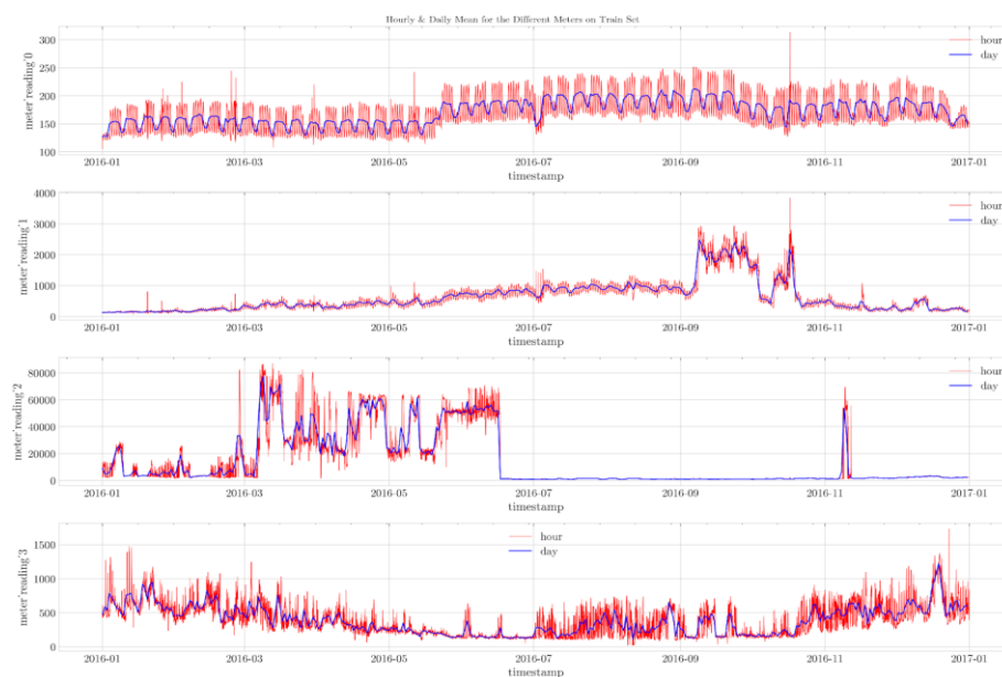
Figure 3: Hourly & Daily Mean Plot of Various Meter from Weather Dataset