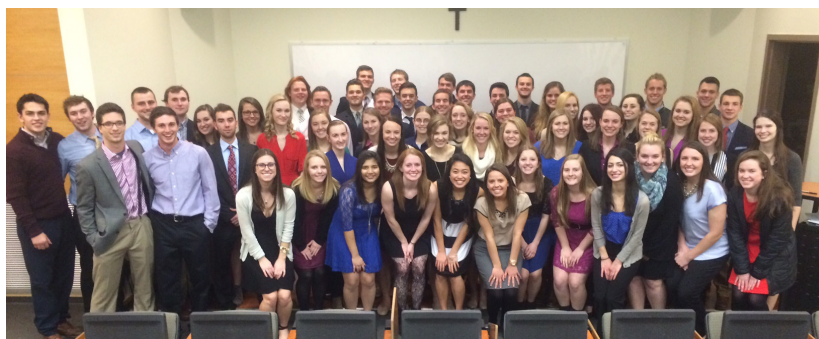
Newly initiated members of Alpha Epsilon Delta