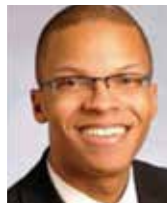
TERRELL L. STRAYHORN The Pursuit of Belonging