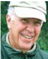
PARKER PALMER (Video) The Heart of Democracy