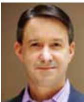
JEFFREY SELINGO College (Un)bound