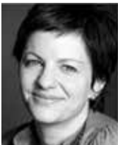
AMANDA RIPLEY The Smartest Kids in the World—and How They Got That Way