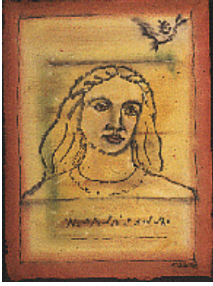
Mary of the Hermits