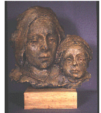
Madonna and Child

The artists of this juried show were asked to focus their work on the Blessed Virgin Mary, thus the show title, "Faces of Our Lady." Profound serenity, grace, and strength are expressed through media ranging from the fluid qualities of oil and charcoal to the solidity of bronze and clay. Marian spirituality emanates from vivid tones as well as subtle shades. Despite the diverse perspectives of Our Lady represented, each piece reflects the unifying thread of man expressing his faith through art.