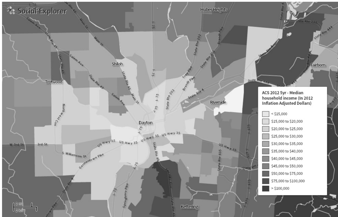
Figure 2 ACS Median Household Income 2012 Trends show a very low-income population in the core and some surrounding areas of the city. 2

market. The census data in 2010 shows that the city of Dayton and its surrounding areas have a low income and high population density. Figure 2 shows the median household income from the American Community Survey (ACS) 2012, 2 depicting how severe the