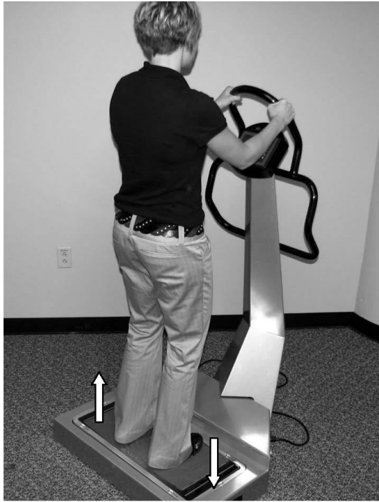
FIGURE 1. Maxuvibe ® vibration platform (Fitgroup BV, Hoogstrat, Holland)

extremities. 26 This type of vibration has also been shown to elicit a significantly great response of the knee extensors than vertical vibration. 10 Vibration frequencies of 2 and 26 Hz with a 6 mm peak to peak amplitude were used because these parameters are consistent with previous WBV research demonstrating increased muscle activity and muscle performance during and following WBV exposure. 10,23 Subjects were asked to wear thin-soled shoes and to use the same shoes on each visit. Foot position was standardized at a width of 13 cm. This foot position ensured that each patient experienced the same amplitude of movement (6 mm peak to peak) which is determined by foot width when using a rotational vibration unit. A knee flexion angle of approximately 25° was maintained and subjects were asked to shift their weight slightly towards the balls of the feet without lifting their heels. This position was chosen because it has been shown minimizes head vibration during WBV. 26 All subjects were asked to hold on to the vibration unit for safety but their arms were positioned to minimize any upper extremity weight bearing (Figure 1).