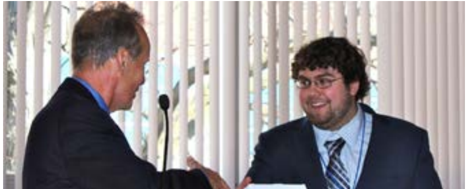
UD/Miami Valley Hospital Healthcare Symposium 2013