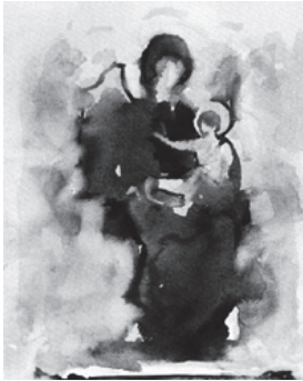
Madonna and Child