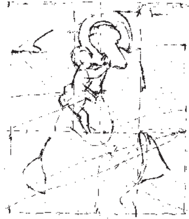
Madonna and Child