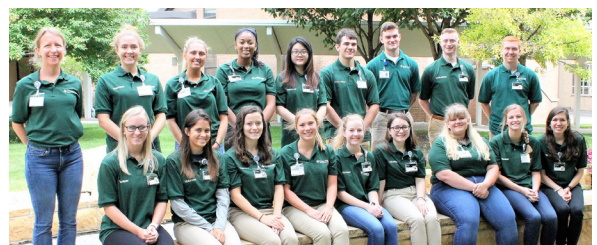
2018 HELP program participants

Orientation Training dates: Fall orientation will be Oct. 4th and Oct. 5th from 9 am to 5 pm. Spring orientation will be Jan. 10th and Jan.11th from 9 am to 5 pm.