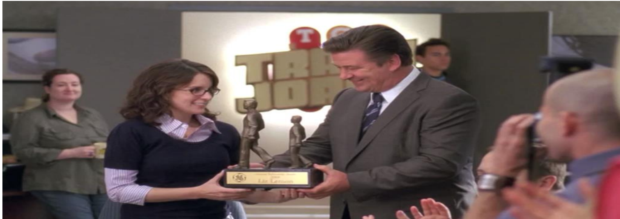
Figure 3. Exemplary followership ( Victoria's leadership blog , 2014, July 25)