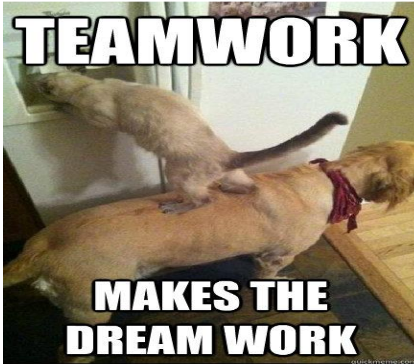
Figure 1. Teamwork.