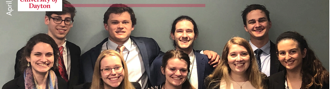
The 10th Annual University of Dayton & Miami Valley Hospital Symposium Student Committee