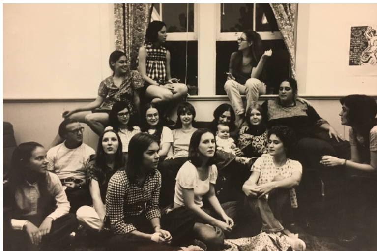
UD students, circa 1986.

The University of Dayton officially became a co-educational institution in 1935, when 31 women students were admitted to the College of Women at UD. When the first co-eds came to campus, women's studies was not yet an established academic field. Some twenty years later, galvanized by the women's movement and the university's concern with Title IX legislation, students, staff, and faculty began organizing to bring women's studies to campus. In 1978, a minor in women's studies was approved.