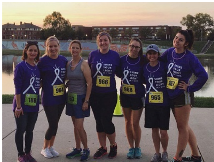
Women's Empowerment House students participated in the Artemis Center and YWCA Shine Your Light 5K, raising awareness and funds for survivors of intimate partner violence in the Dayton community.

Email the Women's Center at womenscenter@udayton.edu to get in touch with the residents.