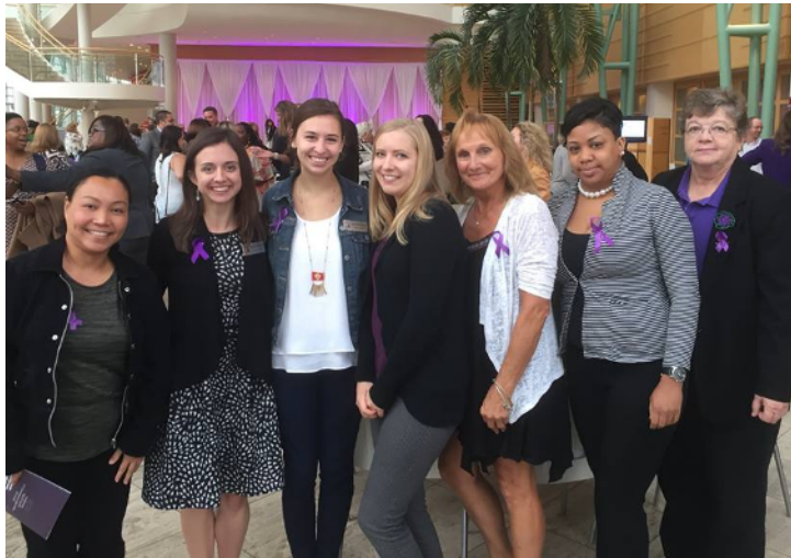
The UD Women's Center staff and Wright State University Women's Center staff at the 15th Annual YWCA YWomen breakfast in October.