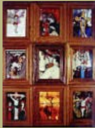
Man of Sorrows Series