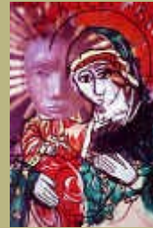
Man of Sorrows series