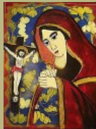
Mother of Sorrows #1