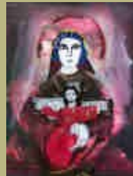
Mother of Sorrows #5