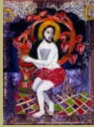
The Mystic Vine