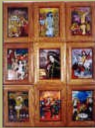
Man of Sorrows Series