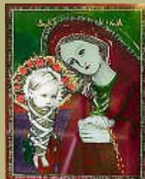
Mother and Child #3