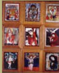
Man of Sorrows Series