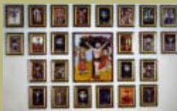
Man of Sorrow