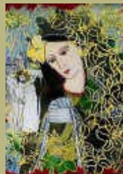
Mother of Sorrows #2