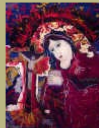
Mother of Sorrows #6