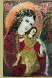
Mother and Child #4