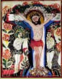
Man of Sorrows (with Adam and Eve)