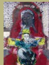
Mother of Sorrows #4