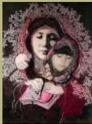
Mother and Child #1