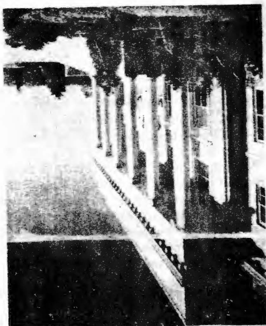
Home of the Marian Library