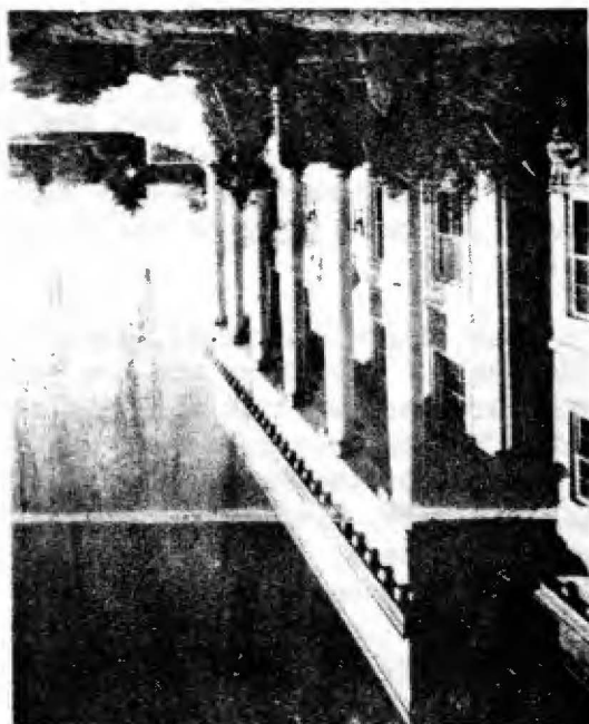
Home of the Marian Library