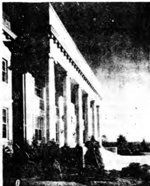
Home of the Marian Library

Newsletter MARIAN LIBRARY University of Dayton Dayton 9, Ohio