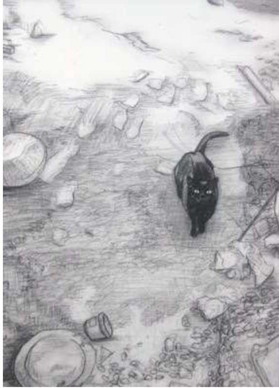
Rome the Cat