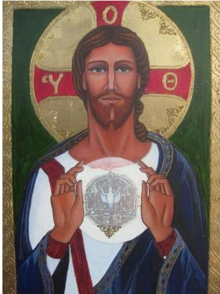
The Indwelling of the Trinity