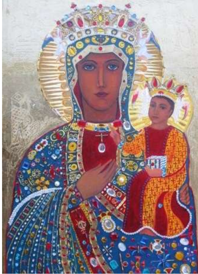
The Madonna of Poland