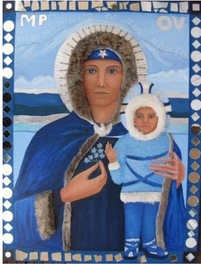
Madonna of the North