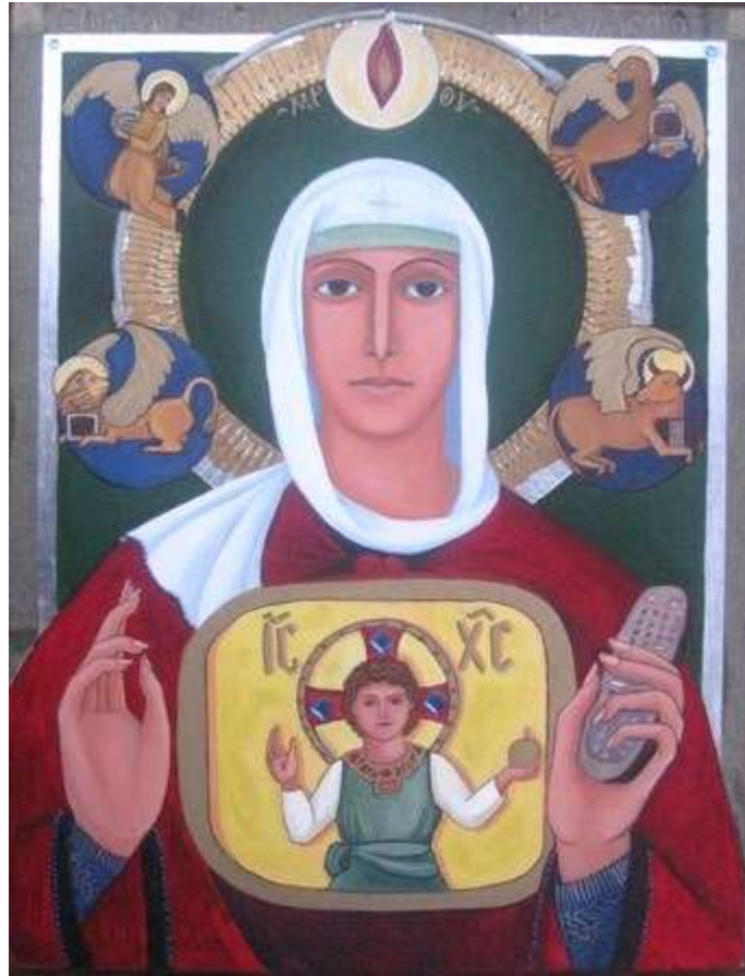
The Madonna of the Media