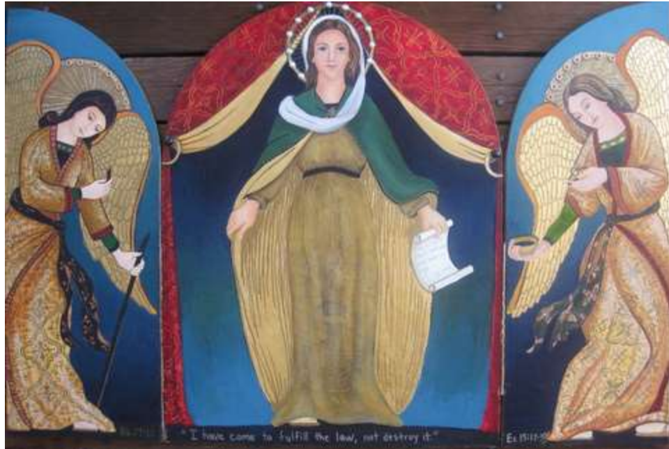
The Madonna of the Ark of the Covenant