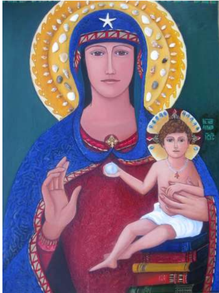
The Madonna of the Holy See