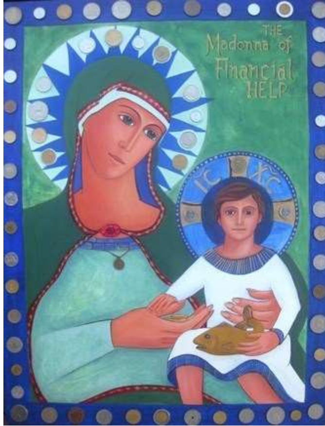
The Madonna of Financial Help