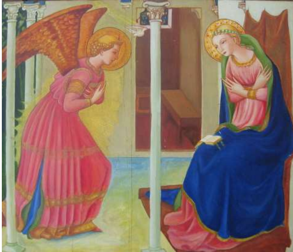
The Fra Angelico Annunciation