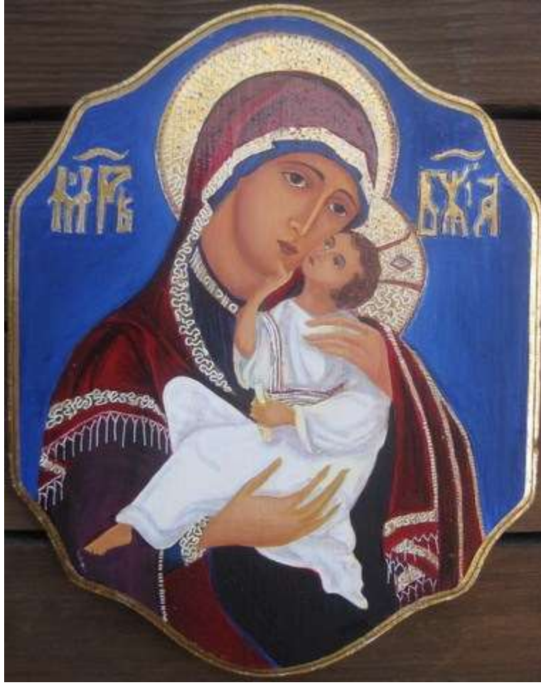
Madonna and Child