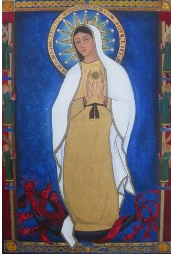
Madonna of the Millennium

5636 San Jose Avenue Richmond, California 94804 510-528-3749