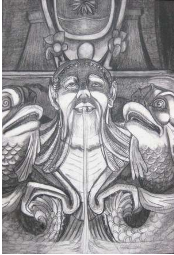
Rome the Fountain