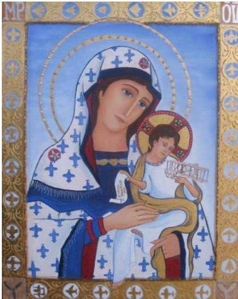
The Madonna of Aviation