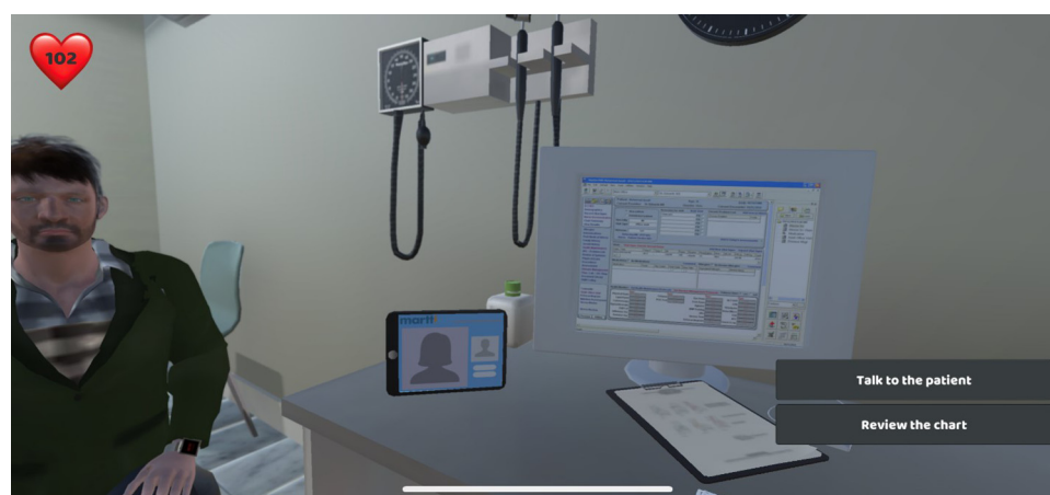
FIG. 2. Image of virtual reality immersion from the provider perspective.

Health professionals were recruited to participate in the simulation with several strategies. These included reaching out to area health organizations, such as community health centers, and offering to do in-person training sessions that included completion of the simulation. We also developed brochures that were distributed to staff in other health organizations that encouraged completion of the simulation on their own time. Of the 364 clinical and nonclinical health professionals who have done the simulation, 158 individuals completed pre- and post-simulation questions. Demographic characteristics of these 158 participants are