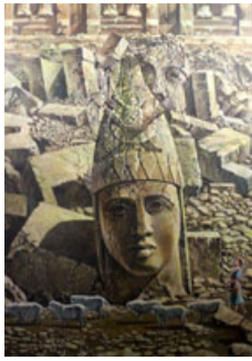
Man Made, God Made