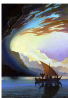
Binding Earth and Heaven