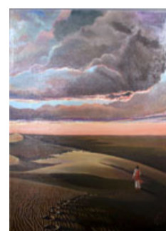
In All Ways