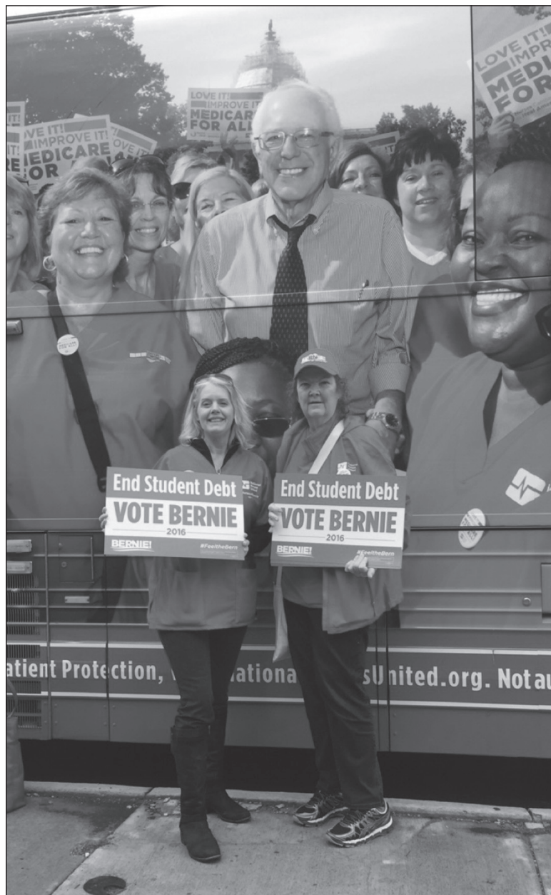
Two nurses for Bernie pose outside of their bus.

To read more about restrictions of political activity at 501(c)(3) nonprofit college campuses, visit flyernews.com/freedom-of-speech-restrictions-an-issue-at-universities/