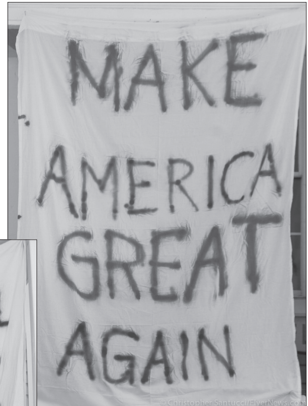
Students in the student neighborhood design sheet signs and display them on their porches. Some of these signs have been taken down per the request of university staff.