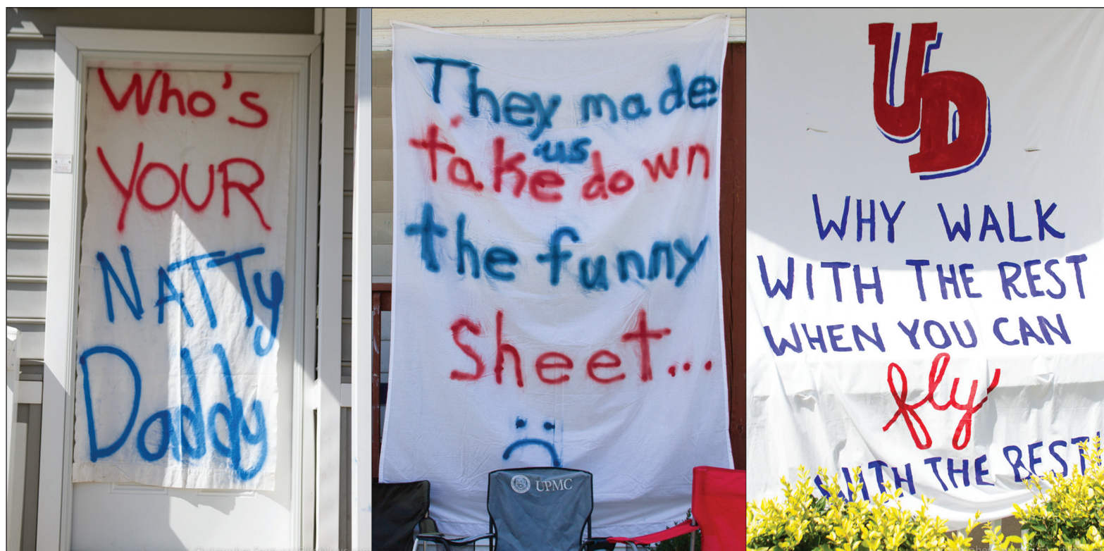
Students often create sheet signs for special events, such as Welcome Weekend, Family Weekend and March Madness. Some, though not all, signs have received criticism for their inappropriate nature.