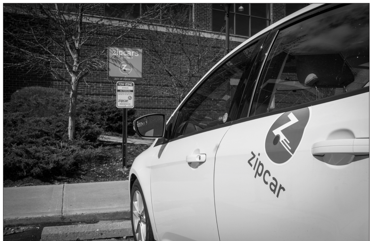
The two Zipcars, a Toyota Prius and a Ford Focus, are parked behind the RecPlex.

For additional information about Zipcar and its services, you can visit its website at zipcar.com/udayton , follow Zipcar on Twitter at @ZipCarU or like on Facebook at facebook.com/zipcar .