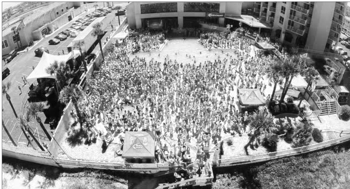
Don't stress about the pool deck.

If you're not prepared when the 2 p.m. hunger strikes on the pool deck, you'll find yourself binge eating on whatever you can first get your hands on; and in Daytona, it'll most likely be pizza. Keep a protein bar in your fanny pack along with a mini water bottle. Here is a list of easy essentials you'll need during your trip that