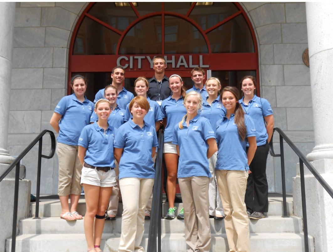
Dayton Civic Scholars

The Fitz Center for Leadership in Community initiates and sustains partnerships within urban neighborhoods and larger communities that both support comprehensive community building and provide a context for broadly connected learning and scholarship .