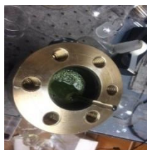
A) Wet algae paste