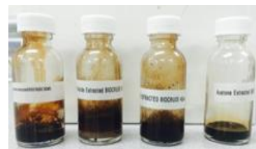
E) Final product samples