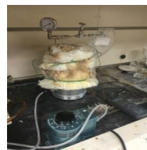
B) Experimental set-up.