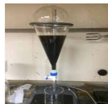
D) Separation of bio-crude