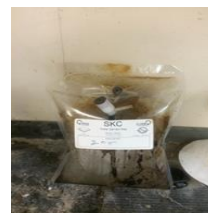
C) Gas sample bags