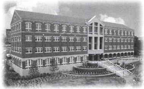
JOSEPH E. KELLER HALL