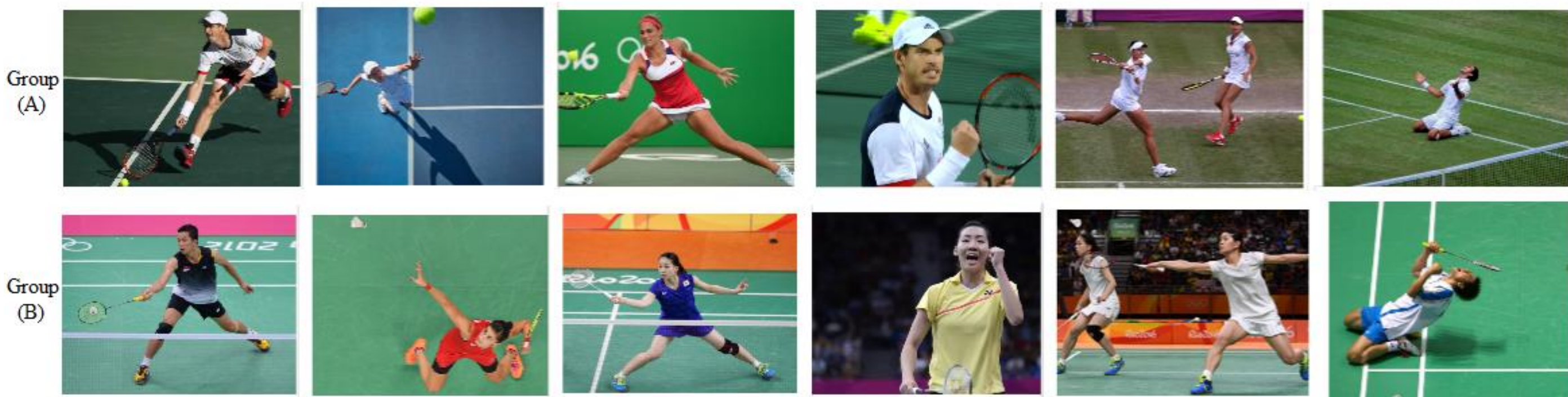
Fig.1. Illustration of similarities between Tennis (Group A) and Badminton (Group B) that can be easily misclassified.

Sport event recognition in Olympic game is still a challenging problem due to the pattern similarities in many sports. These similarities include outfit, equipment, and game field. For example, Tennis and Badminton as shown in figure 1, share numerous features including racquets, field outline and color, net, and outfit. Such scenario is confusing for most traditional CNN which makes it challenging task for convolutional networks to successfully classify correctly these types of sport events.