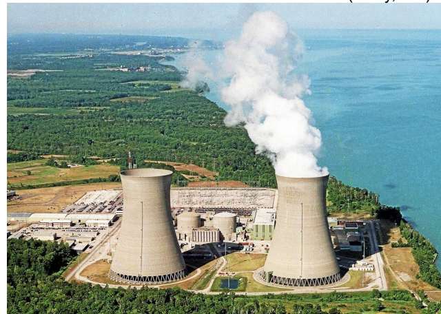
The News-Herald (Perry, OH)