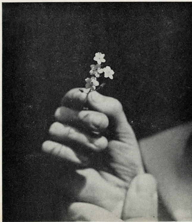
Eyes of Mary more popularly known as Forget-Me-Not

This growth begins as we cultivate Our Lady's Flowers before her image in her garden, believing in her, loving her, recalling her, proclaiming her praises, praying to her and meditating on her virtues, graces, privileges, mysteries, joys, sorrows and glories. Then,